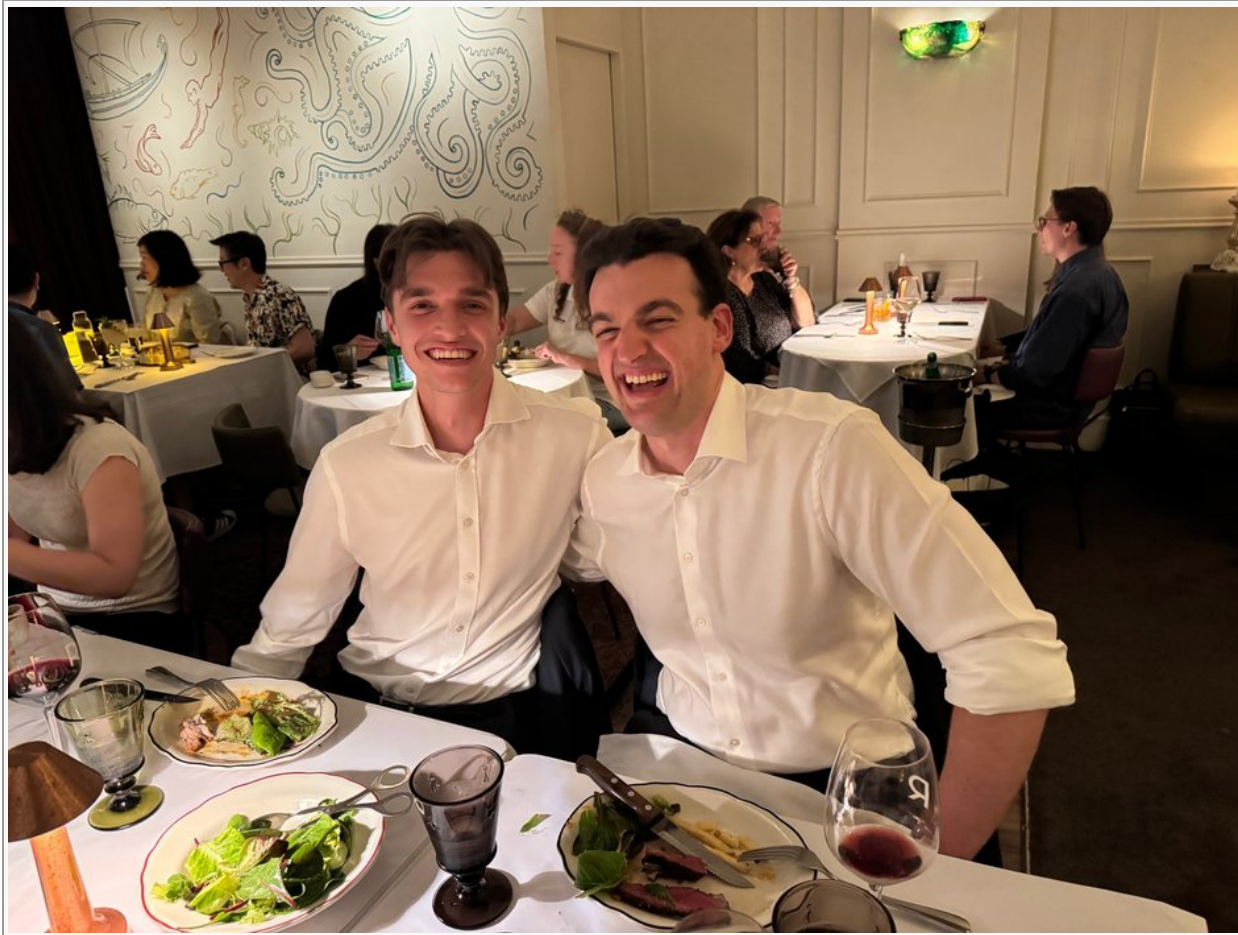
2025 BFSLA Academic Colloquium · Sydney